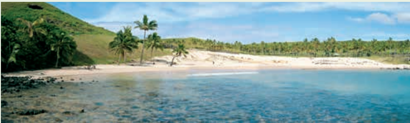
*moai: stone statues of human figures